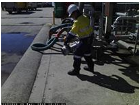
Task 2: Valve operation Total time/shift: up to 4hrs Task duration: 30mins at a time